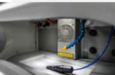
EASY ACCESSIBLE CONTROLS