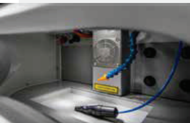
EASY ACCESSIBLE CONTROLS