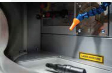
EASY ACCESSIBLE CONTROLS